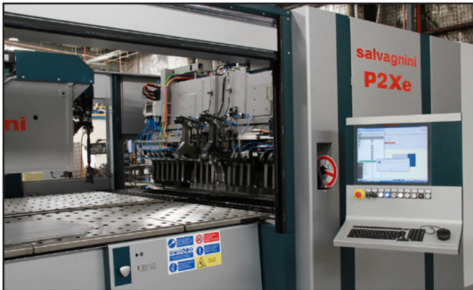
salvagnini P2Xe CNC panel bending machine

TRUMPF is a high-tech company that focuses on manufacturing technology, laser technology and medical technology. They offer both innovative and high-quality products in sheet metal processing, laser-based production processes, electronic applications and in hospital equipment.