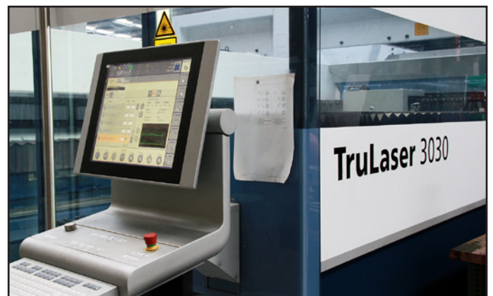
TRUMPF TruLaser 3030 CNC laser cutting machine

We would like to invite you to visit our showroom and manufacturing facility to view our production capabilities live in action and meet with our sales team to discuss products to meet your requirements .