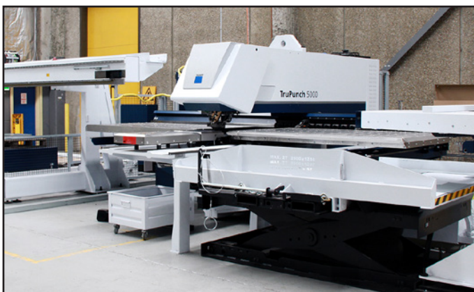
TRUMPF TruPunch 5000 CNC turret punch