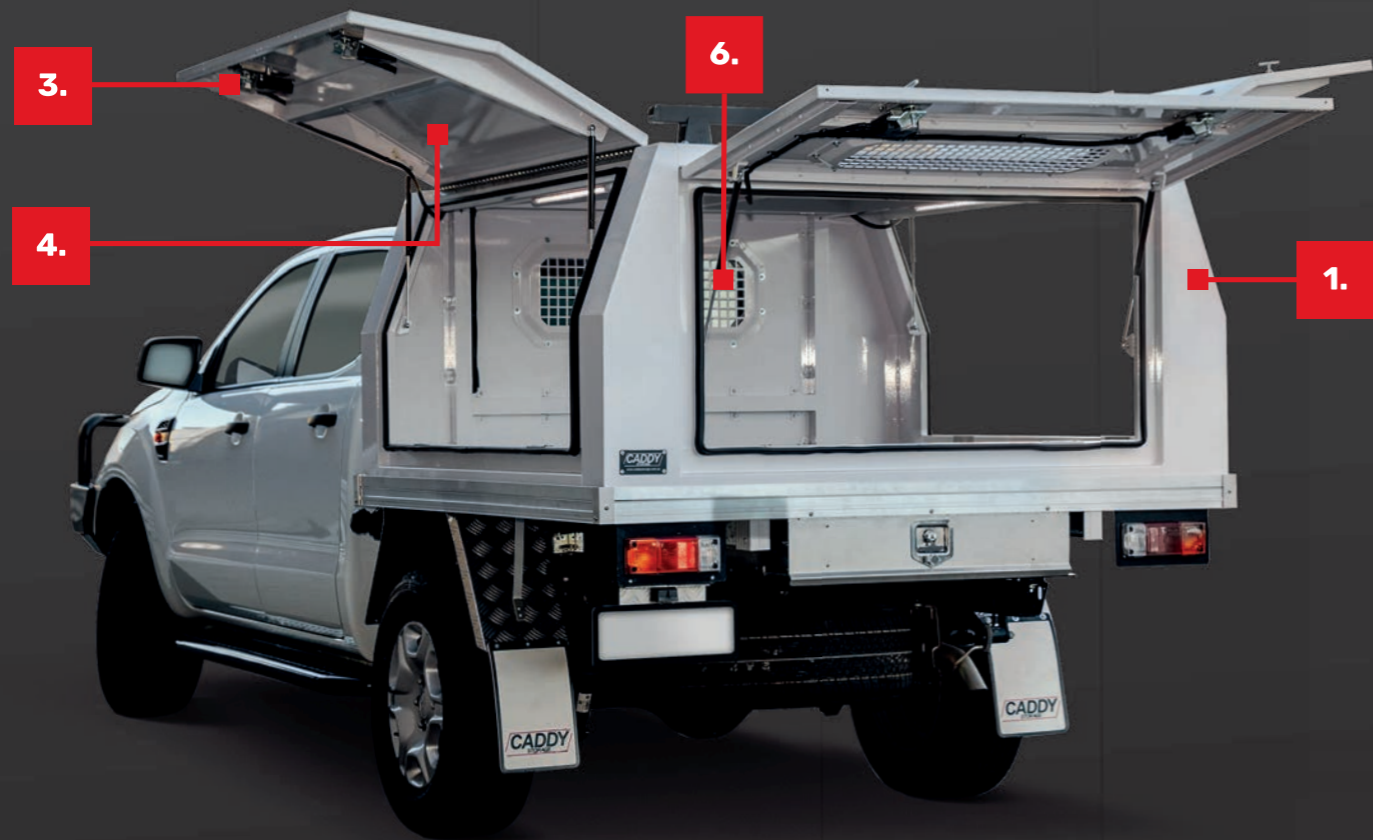
Service body with white Powder coat Finish