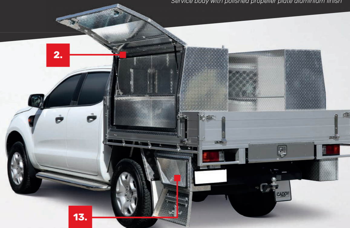
Toolboxes with polished propeller plate aluminium finish