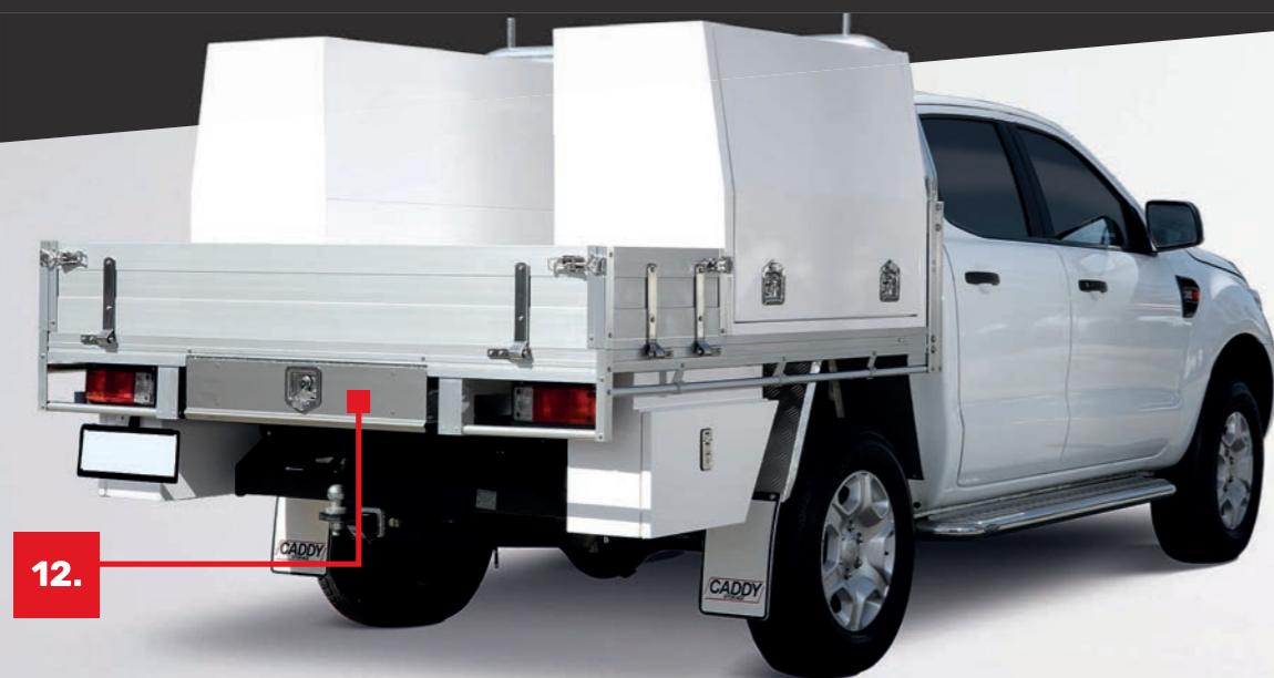
Toolboxes with white Powder coat Finish